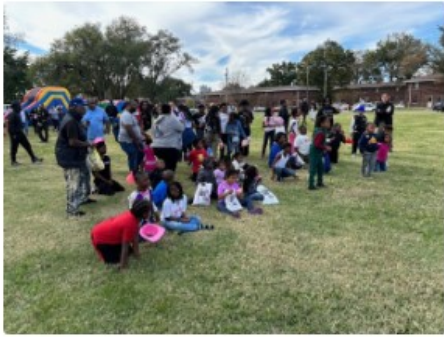
Christian Activity Center, East St. Louis